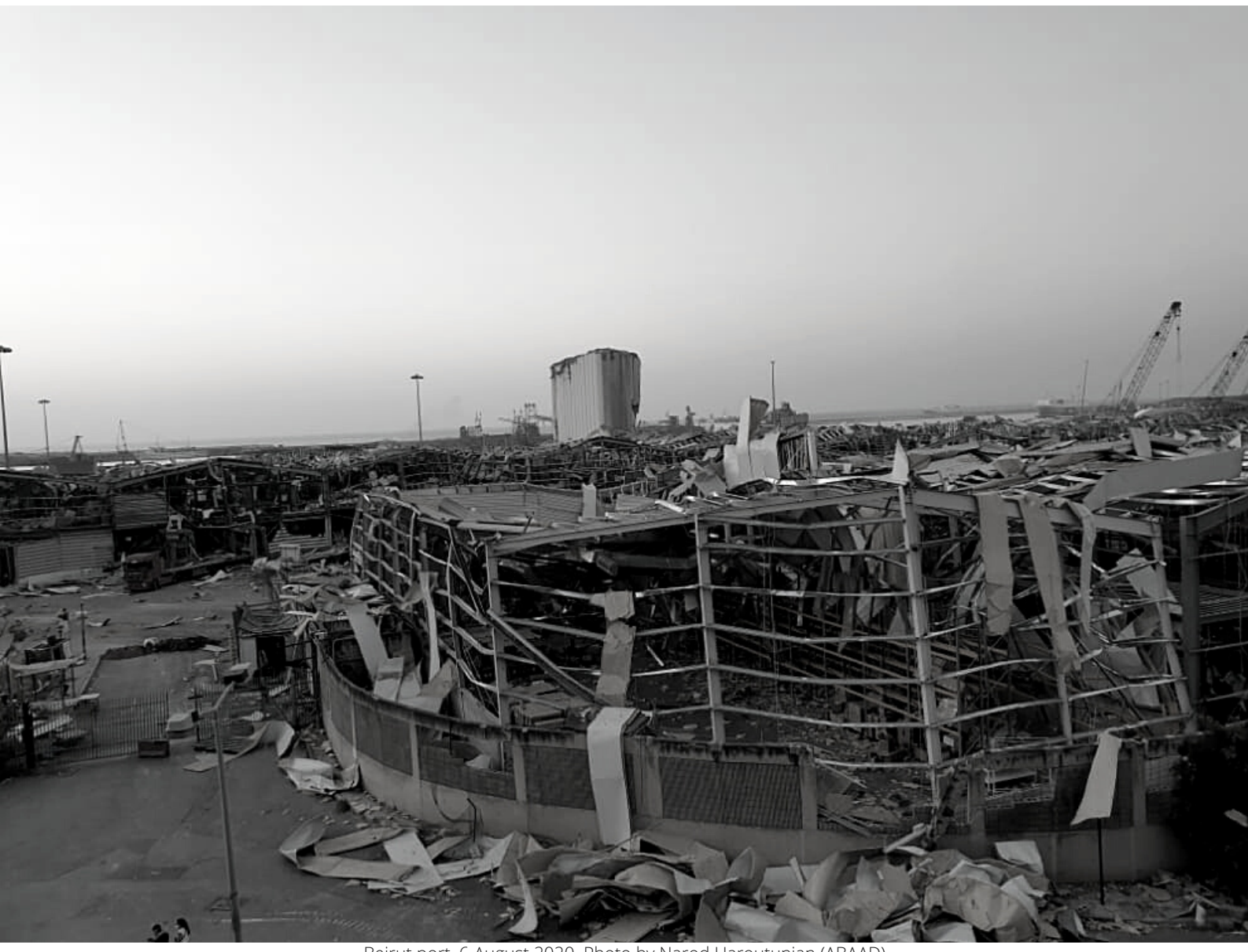
Beirut port, 6 August 2020.