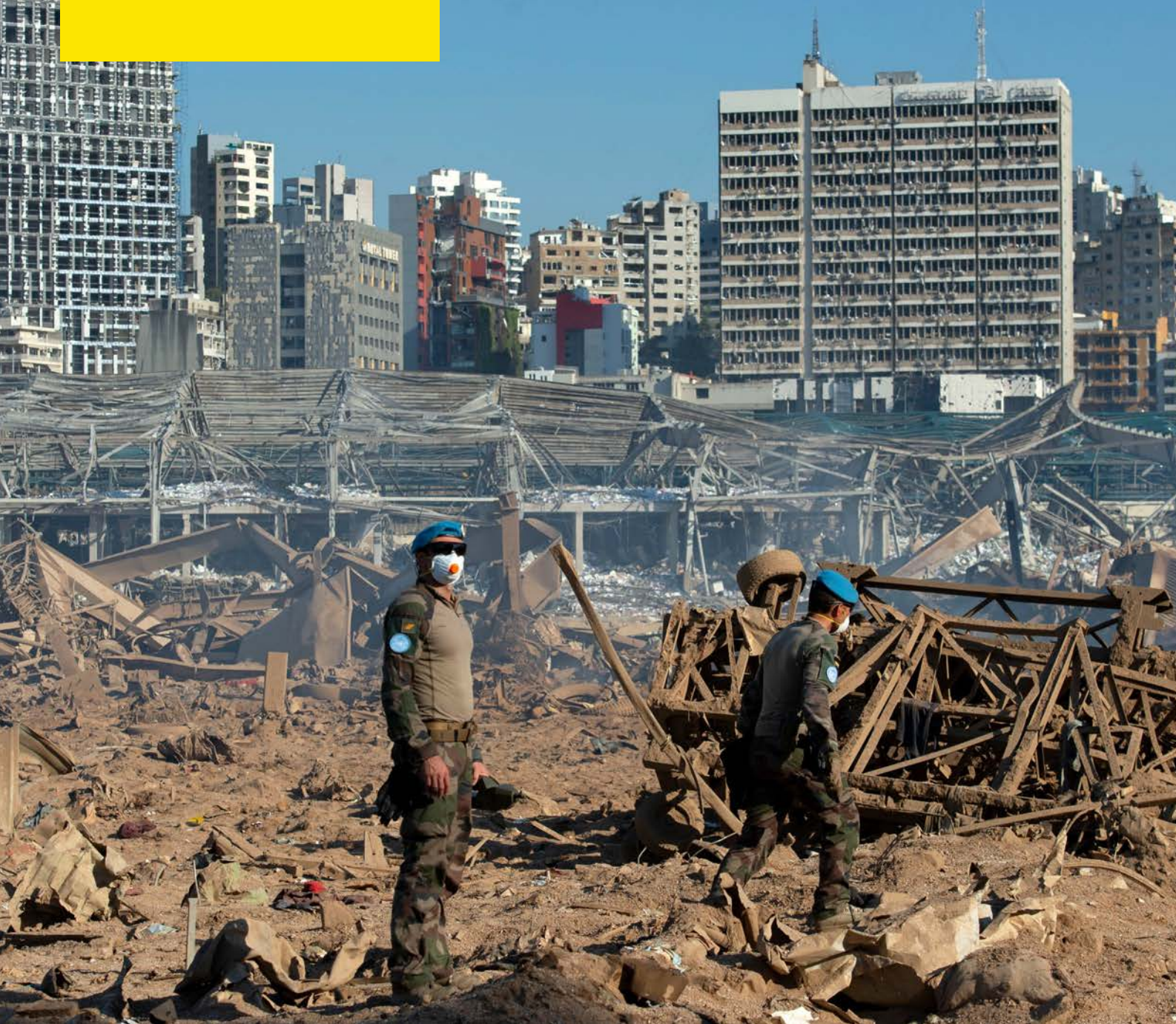
Beirut port, 5 August 2020.