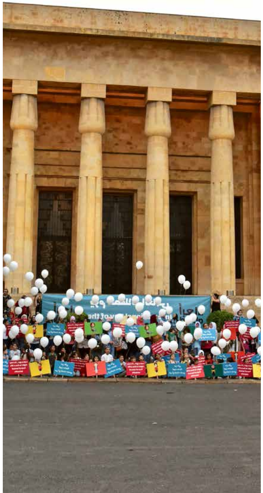
International Girl Child Day commemoration and candle vigil for deceased women's rights activist Nadya Jouny, October 2019

All Lebanese shall be equal before the law. They shall equally enjoy civil and political rights and shall equally be bound by public obligations and duties without any distinction.