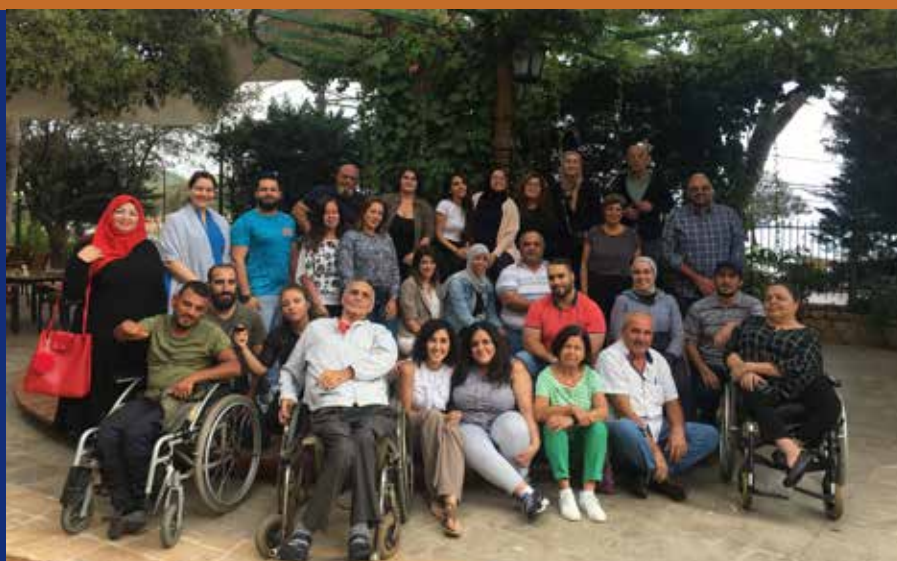
Lebanese CSOs close a 3-day camp on working towards national common inclusive policies

Intersectionality, n. – the interconnected nature of social categorizations such as race, class, and gender, regarded as creating overlapping and interdependent systems of discrimination or disadvantage ( Oxford Dictionary ).